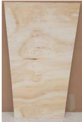
Center Divider (D)