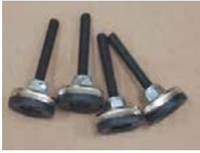
4 – Levelers