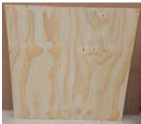
2 – Top / Bottom Shelf (C)