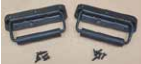
2 – Decorative Side Handle (with Hardware, 10 Screws)