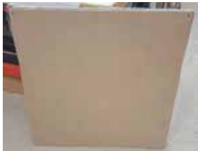
2 – Top / Bottom Shelf (C)