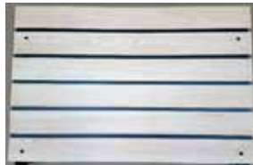
2 – Side Panel/ Metal Legs (A)