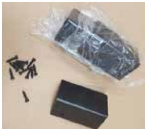
8 – Black Metal Corner Protectors (with Hardware, 32 Screws)