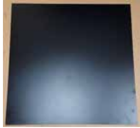
Insert Liner (E)