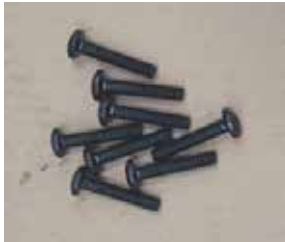
1 – Hardware Bag, 16 Long Screws (For Side Panels & Top/Bottom Shelf)