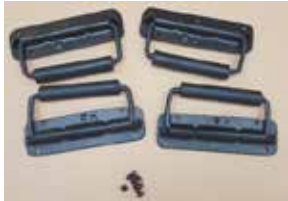
4 – Decorative Side Handle (with Hardware, 20 Screws)