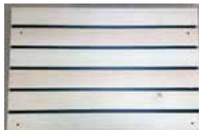
2 – Side Panel No Legs (B)