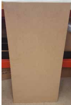
Center Divider (D)